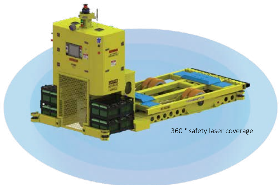
360 ° safety laser coverage

In addition to following OSHA standards, all controls provided are also ISO9001 approved. A series of procedures ensure that quality and reliability is always built into each system.